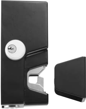
GL1 Electromechanical Gate Lock