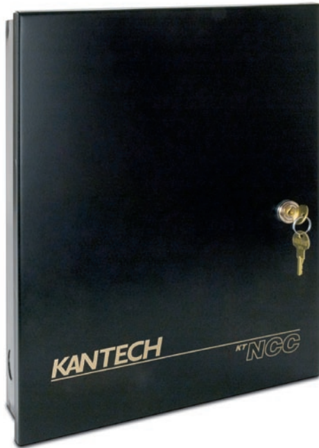
Note: North America model shown