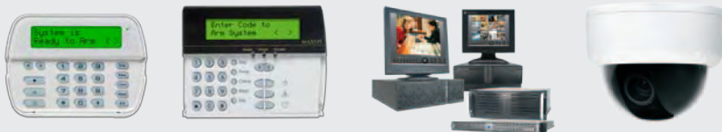
DSC PowerSeries and MAXSYS Alarm Panels